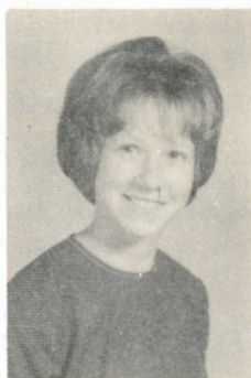
Sec. of State